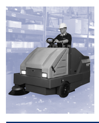
There are various floor sweepers available for meeting different cleaning needs – from sweepers that control dust and pick up heavy debris, to sweepers that vacuum up light debris.

"Clean can mean anything from getting rid of chunks of dirt on the floor to creating a shiny, scuff-free surface. Your facility's cleanliness goal will be a factor in your equipment choice."